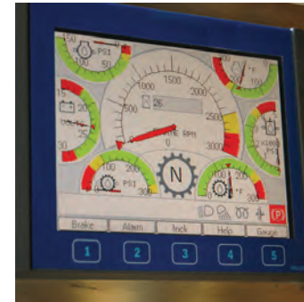
On-board diagnostic monitoring to protect key critical systems