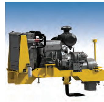
The proven reliability of Mercedes in an integrated removable power module