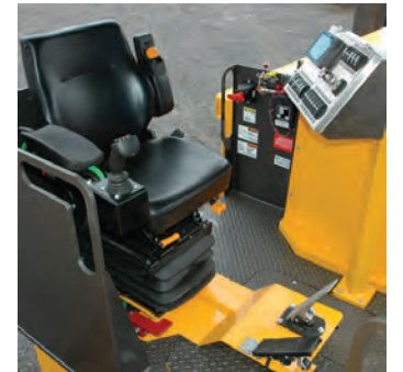
Comfortable swivel hydraulic suspension seat, dual armrests and joy-stick control