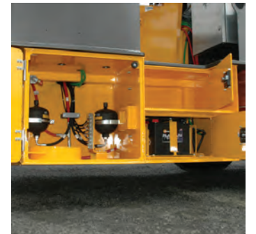
Compartments for operator tool box, lubricant storage, centralized greasing, brake accumulators and batteries