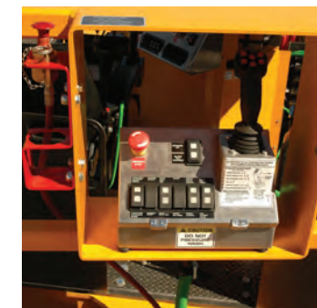
Remote traction and steering control, including stabilizer, start-stop and emergency stop