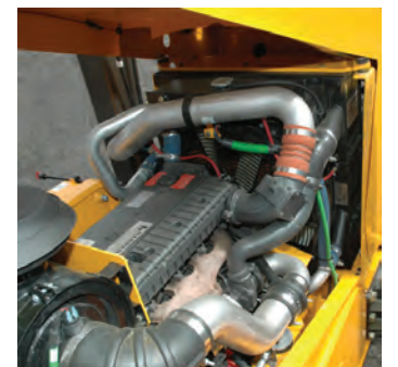
Hot and cold sides designed for additional safety