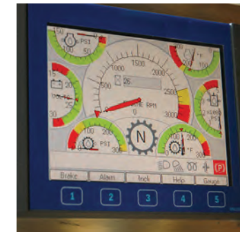
On-board diagnostic monitoring to protect key critical systems