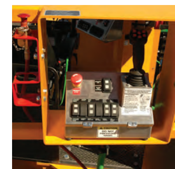
Remote traction and steering control, including stabilizer, start-stop and emergency stop