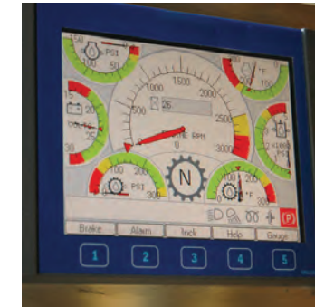
On-board diagnostic monitoring to protect key critical systems