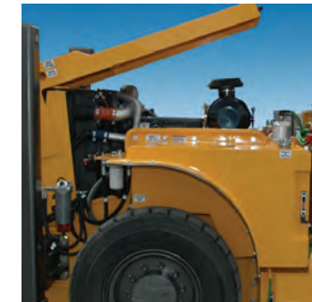
Easy access for pre-operational checks and servicing